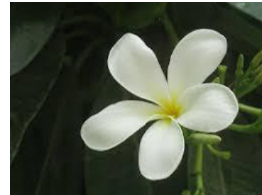
The story of the Milk and the Jasmine Flower