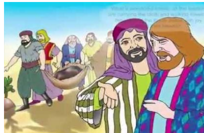
The story of Muhammad and the Black Stone