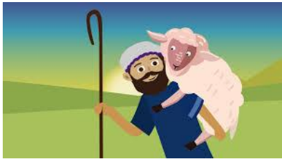
The Lost Sheep Story

The Guru Granth Sahib is the Sikh Holy Book written by Guru Nanak.