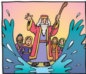
The story of Moses