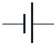
battery or cell

When scientists draw electrical circuits, they use scientific symbols to show different components .