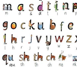
Speed Sounds Set 2