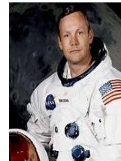
Neil Armstrong 1930—2012 First man on the moon.