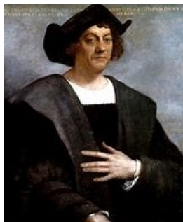
Christopher Columbus 1451— 1506 Sailed to America