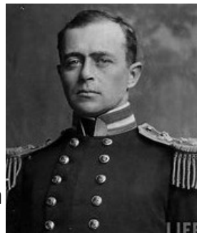
Captain Scott 1869—1912 Explored Antarctica